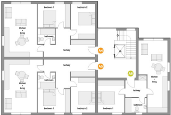
Proposed First Floor Plan 1:500