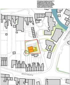
Site Location Plan Apartment Scheme 1:1000